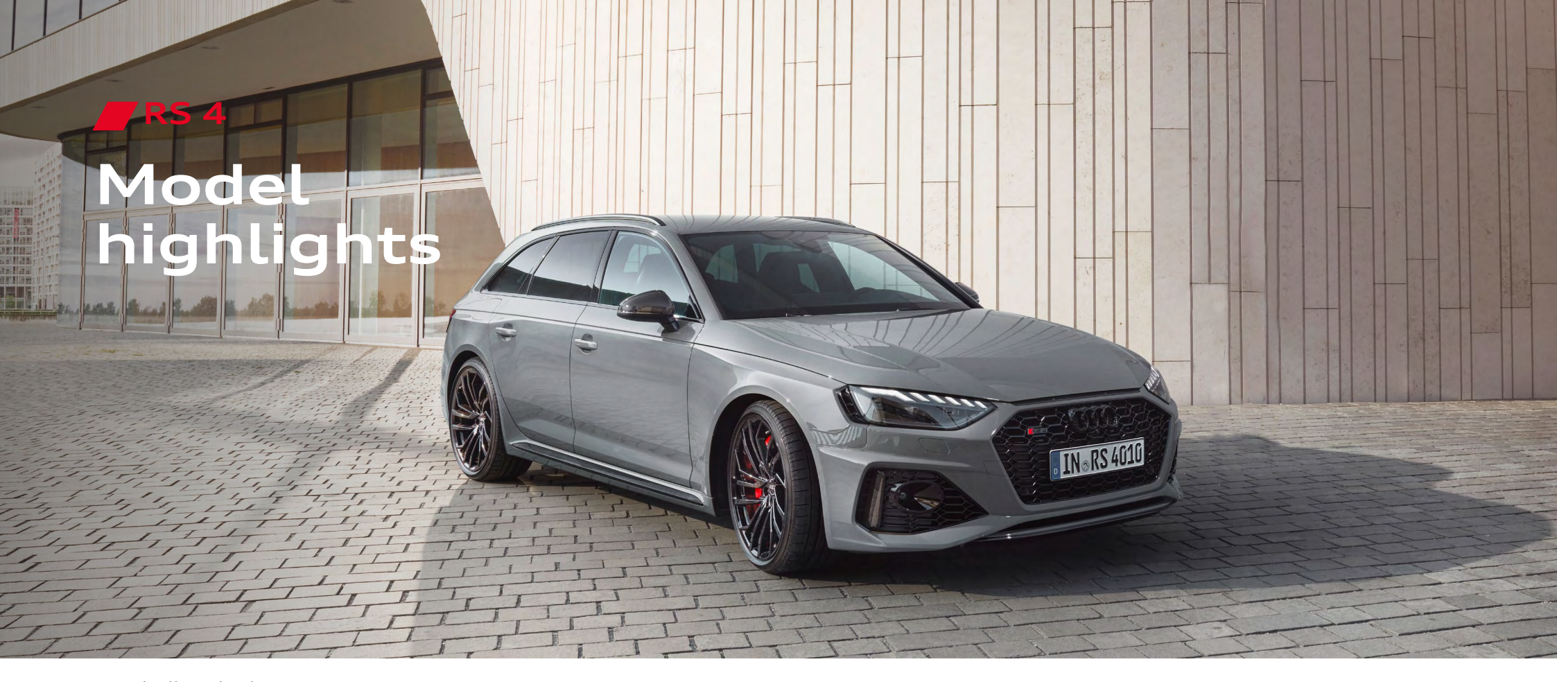
20-inch alloy wheels