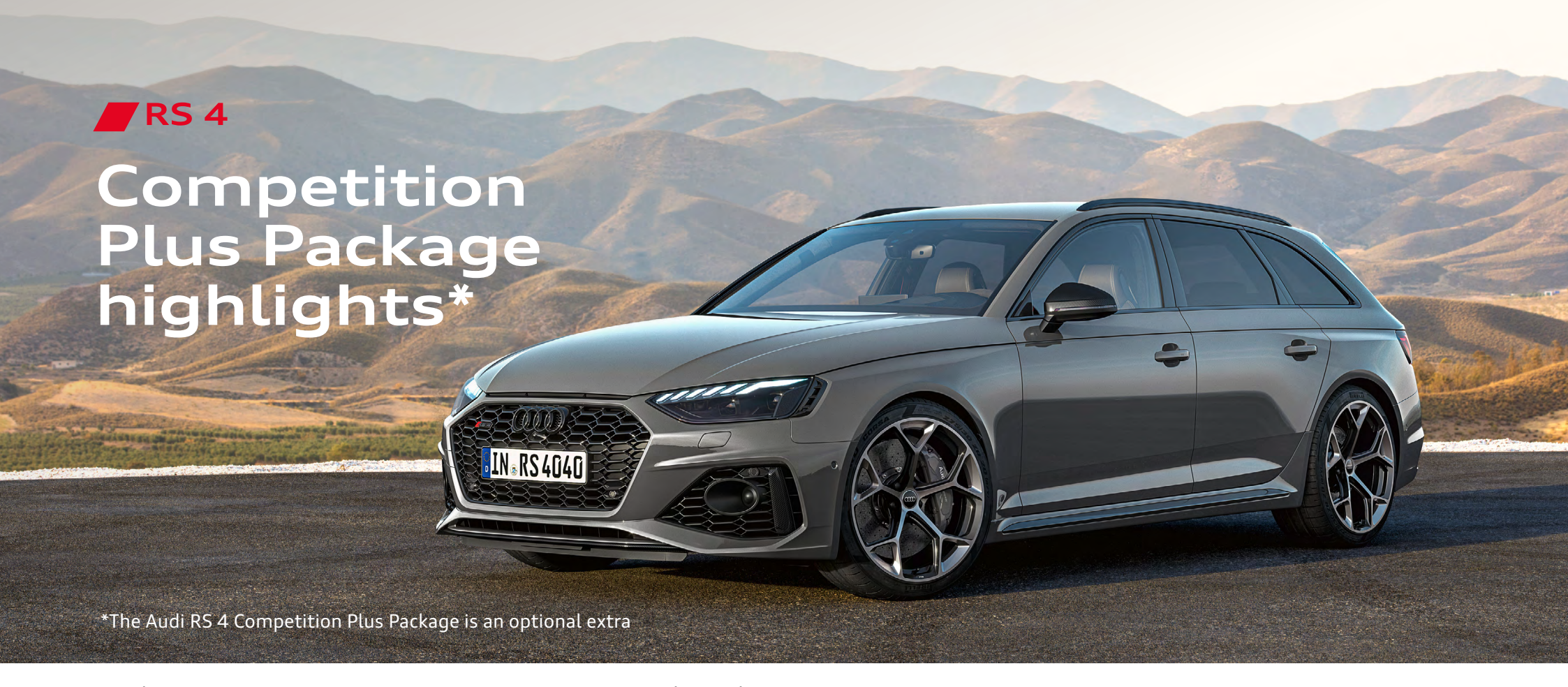
RS coil-over suspension